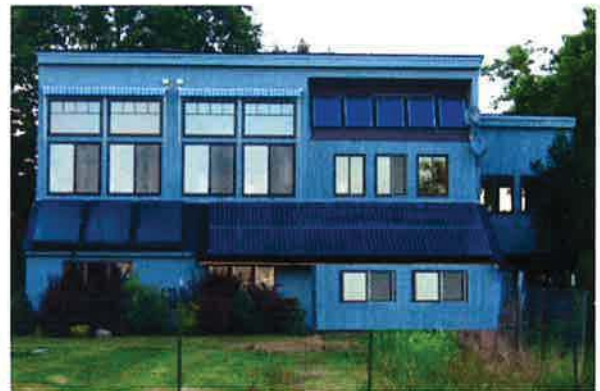
Proposed (window configuration may change)

Background: In May 2010 we applied for and received a permit to remove a deck and extend an existing roof to make room for solar panels. At that time the space under the new roof was not enclosed.