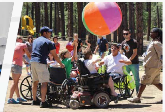
Cost for one physical therapy consultation at an MDA clinic: $150

The critical dollars raised will support MDA's mission to save and improve the lives of people fighting neuromuscular diseases right here in our community. Thank you!