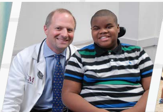
Cost of professional fees related to initial diagnostic work-up at an MDA clinic: $300